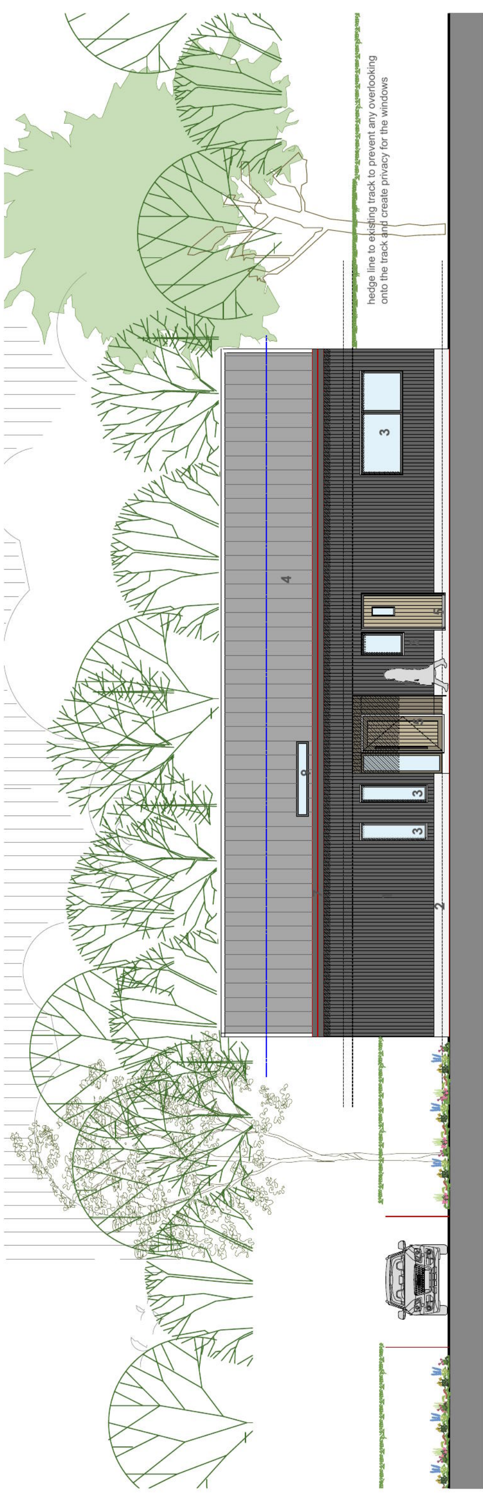
03-Proposed front elevation @ 1:100

This drawing is copyright and is not to be reproduced. The contractor will be held responsible for the accuracy of works involving the setting out and checking of all dimensions on the drawing and on site. Dimensions must not be scaled from this drawing.